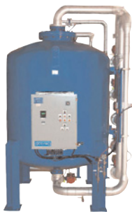
Spectrum Micro Media Filter™